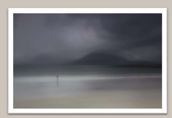
2<sup>nd</sup> Place Digital A – Andy Harbin – Contemplation