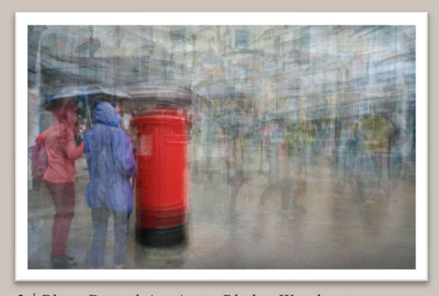
3^{rd} Place Digital A – Annie Blick – Wet day in town.