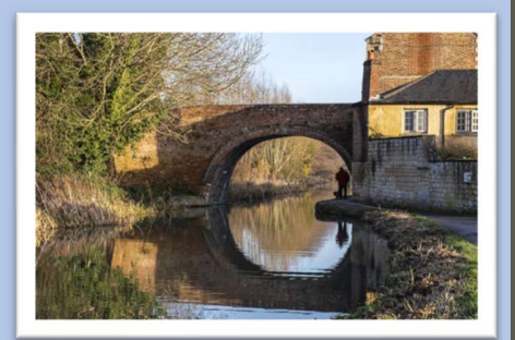
"Nutshell bridge Stroudwater Canal"

Gerry has a wealth of technical knowledge about gear both camera and computer — if you are looking to update your computer just have a chat to Gerry and it will potentially save you an awful lot of "Google" time! Gerry also runs the U3A Group for photography, so if you are looking for some U3A action give Gerry a shout and he will no doubt give you all the details.