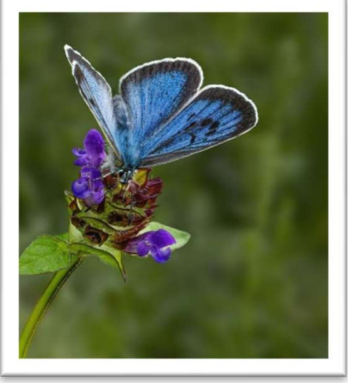
"Large blue nectaring on selfheal"

We may all gradually improve, ever mindful of Henri Cartier-Bresson's sentiment that "your first 10,000 photographs are your worst"!