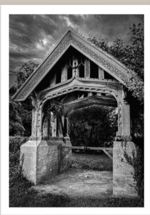
See more on our website: www.stroudcameraclub.co.uk