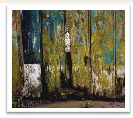
Paddy Doyle - "Boot lace eye view" 3rd place Digital B