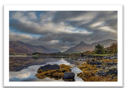
Highly Commended Digital A

Open 3 was a very well supported competition and enabled us to run a Group A and Group B competition for the first time this season. Many congratulations to all the members who entered the competition and in particular to those from Group B our foundation group. We will continue to monitor the situation as to whether it is viable to run both Group A and Group B as separate classes in all future competitions, so please Group B members do enter to enable us to continue this excellent basis.