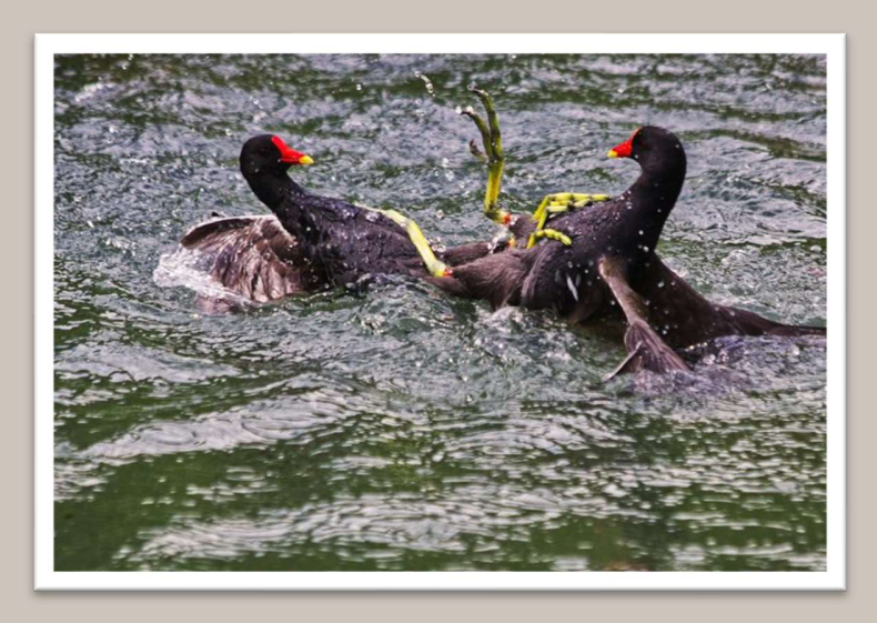
"Moorhens fighting" - Rhys Owen - 1st Place Digital B

"It is more important to click with people than to click the shutter." - Alfred Eisenstaedt