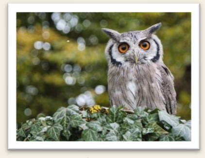
Group - 3<sup>rd</sup> Place – René Cason "Bokeh of feathers...."

Ray took us through various techniques using adjustment layers and then showed us the use of textures and the benefit of brushes that are not just the "soft round brush" – including how to obtain Kyle's brushes and to make our own. After covering how to make ourselves a personalised watermark the evening ended with a quick lesson on dodge and burn, using the overlay blend mode for dodging and the soft light blend mode for burning. Don't forget to adjust your opacity and flow and build up gradually too!