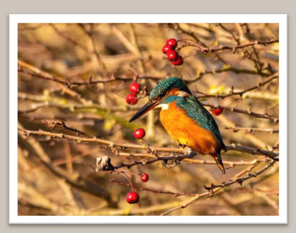
"Just waiting" – Allan Jeffcutt