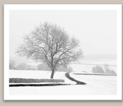
"White wedding" - Steve Vines