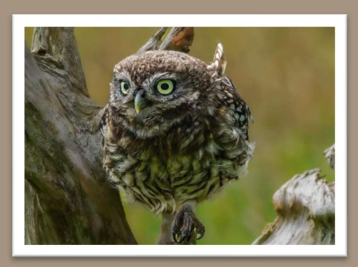
"Little Owl" – René Cason AFIAP