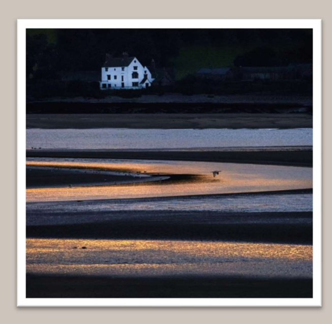
"House across the river" - Annie Blick