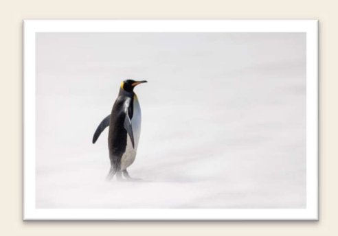
"King penguin in blowing sand "- Leslie Holmes