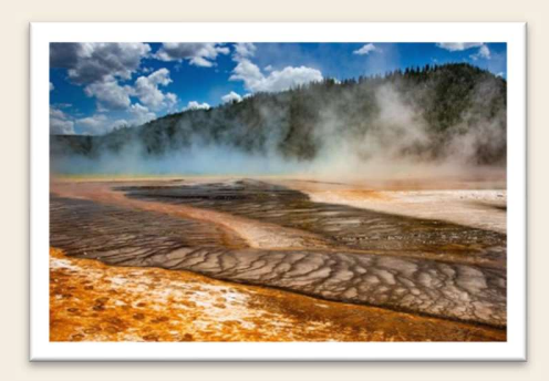
"Grand prismatic - Yellowstone" – Kerrin Malone