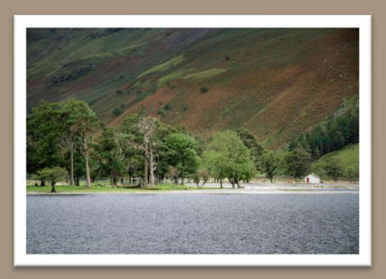
"Gatesgarth Beck Buttermere" – Derrick Whitmore