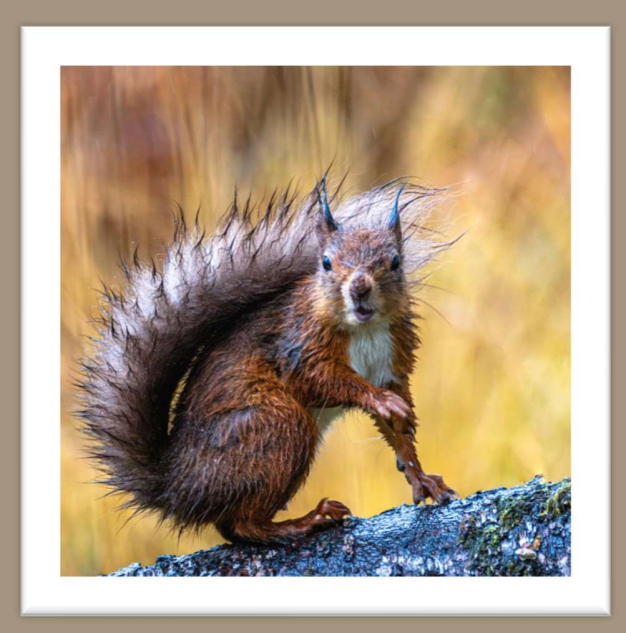
"Surprised soggy squirrel" - Ian Peters