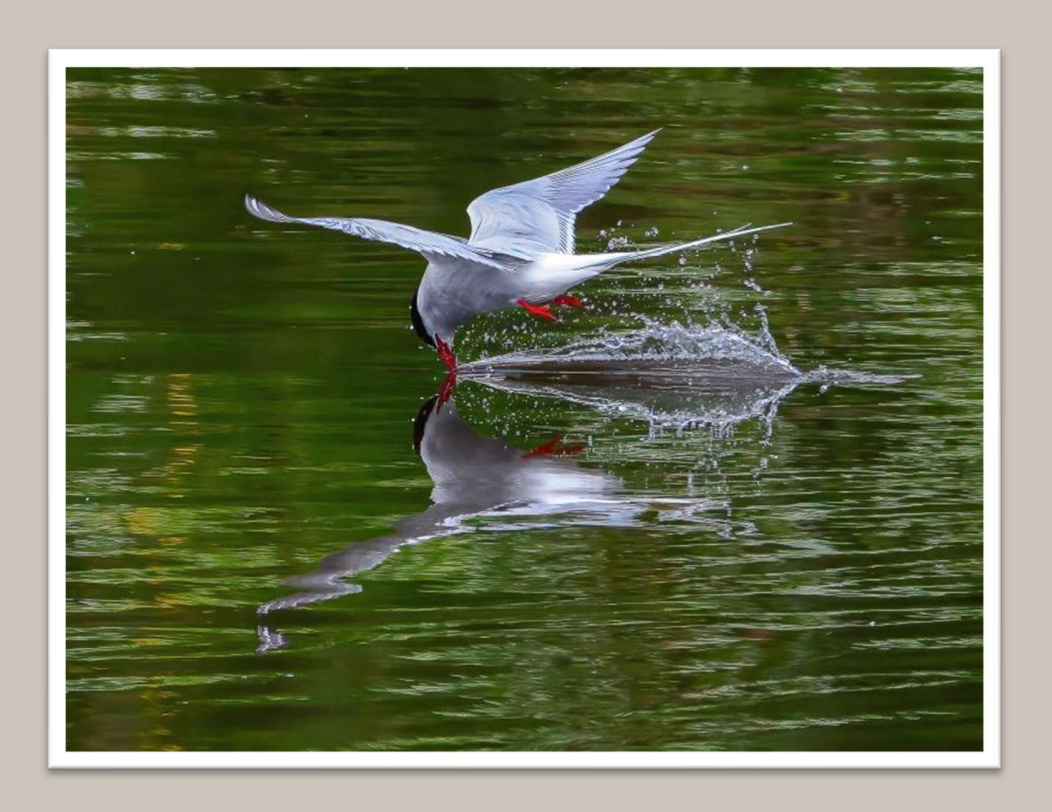
"Arctic Tern fishing" – René Cason AFIAP

"Practice: the key that unlocks the door to mastery"- Anon.