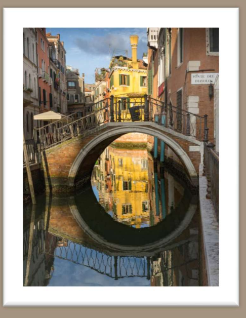
"Devil's bridge Venice" – Mick West