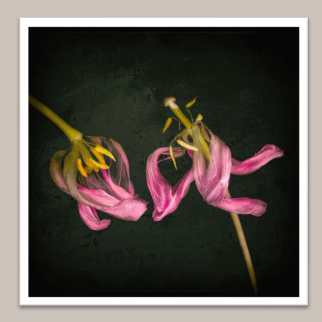
"Viva Magenta" – Trish Bloodworth EFIAP