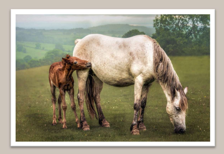
"Wild colt foal" - Trish Bloodworth EFIAP