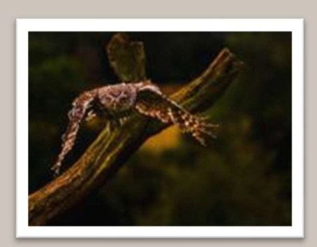
"Little Owl approaching" – René Cason AFIAP