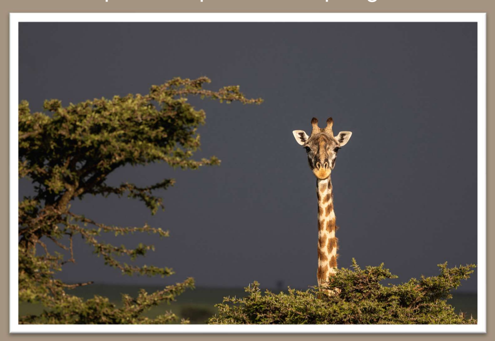
"Poking Up" – Leslie Holmes