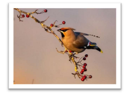
"A waxwing winter" – Allan Jeffcutt

For more information, including contact emails for <u>all</u> the committee please go to www.stroudcameraclub.co.uk