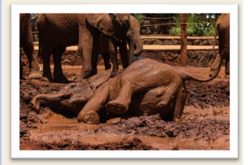
Sheldrick Elephant Orphanage