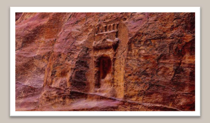
"Nabatean doorway"