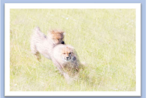
Cheetah cubs – slow shutter

Below are just a small selection of Leslie's super images.