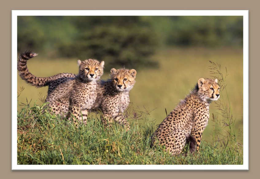
"Cheetah cubs"