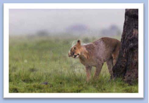
Shaking the rain off