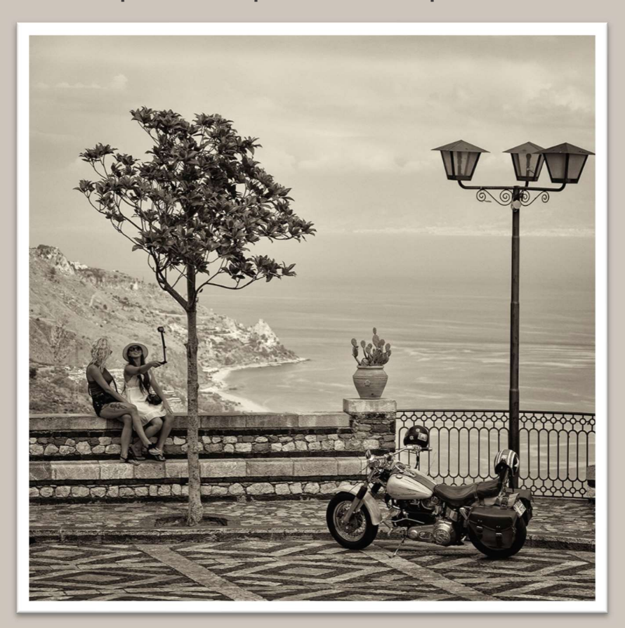
"A selfy in Sicily" – Geoff Perrett