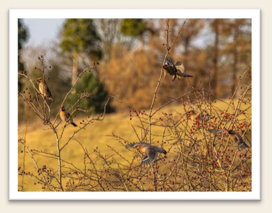
"Feasting waxwings" – Ian Peters