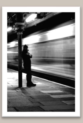
"Malvern railway station man" – Carol Barchou