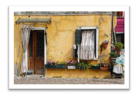
"Cleaning day" - Derrick Whitmore

This saw 15 different members entering the print competition and 28 entering digital images – this is a great representation from our membership – with nearly 60% of our members entering this competition.