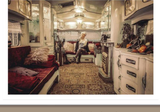
"Patrice" – Trish Bloodworth EFIAP