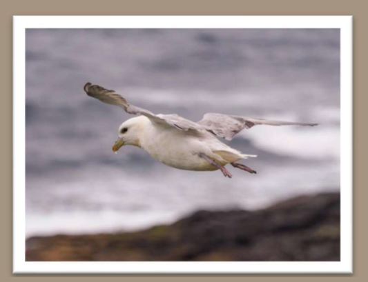
"Northern fulmar" – René Cason AFIAP