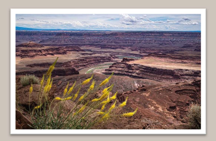
"Canyonlands of Utah" – Kerrin Malone