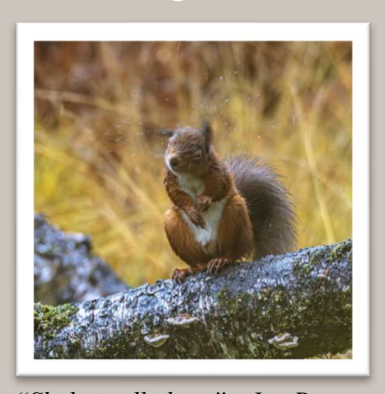
"Shake it all about" – Ian Peters