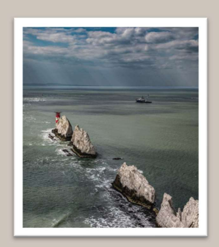
"The \ Needles"-Nigel \ Bowsher