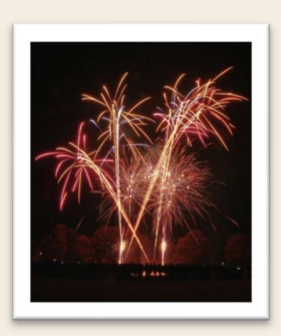
"Chalford\ Hill\ fireworks" - Glyn\ Heskins