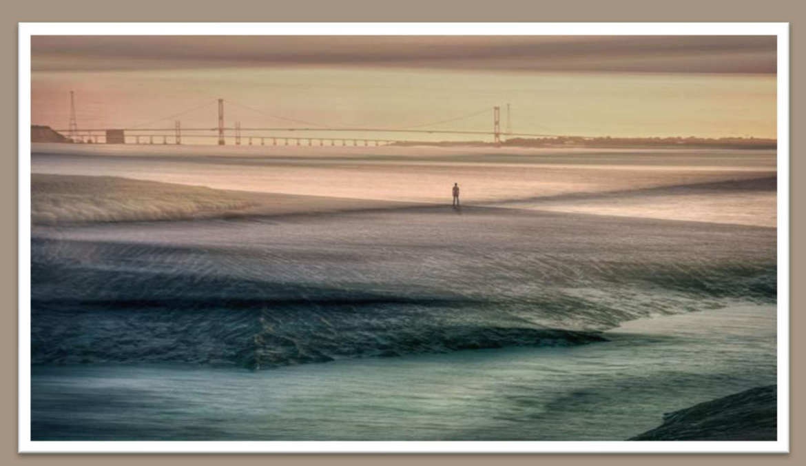
"What lies beyond" - Annie Blick