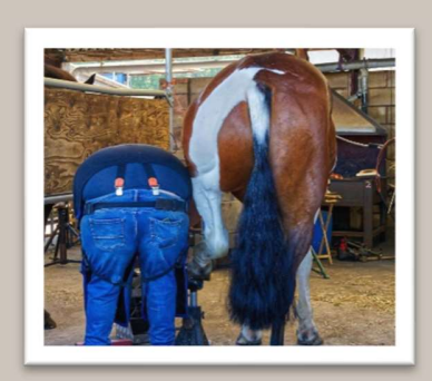
"Mine is bigger than yours" – Rhys Owen