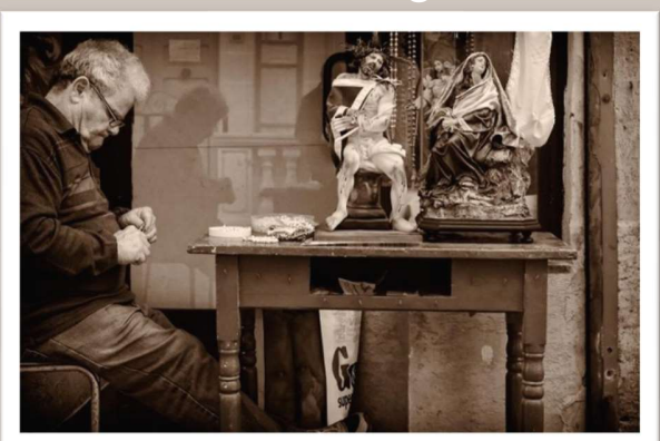
"A Malta street scene" – Geoff Perrett