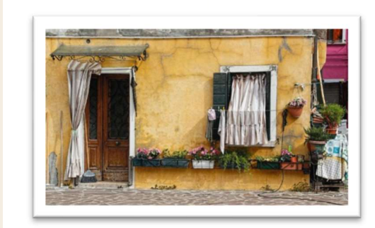
"Cleaning day" - Derrick Whitmore