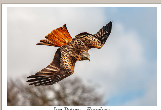
Ian Peters - Fearless