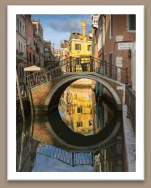
"Devil's bridge - Venice" - Mick West