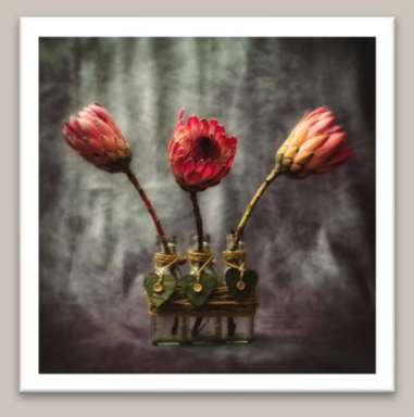
"Flowers 03" – Geoff Perrett