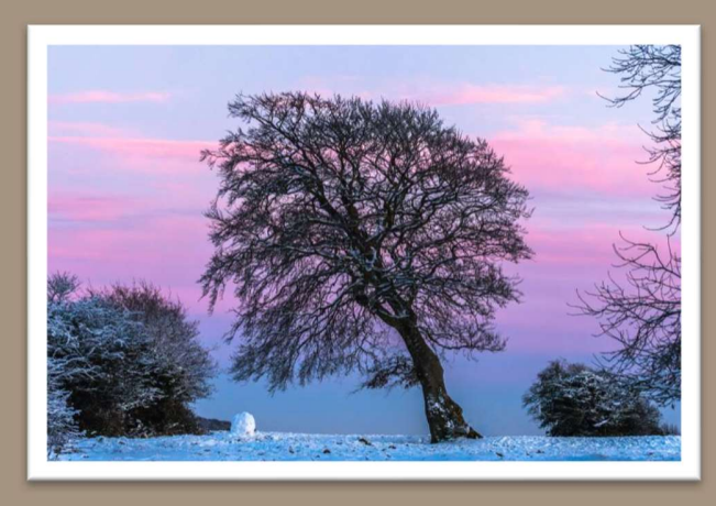
"The lone tree - RIP" - Ian Peters