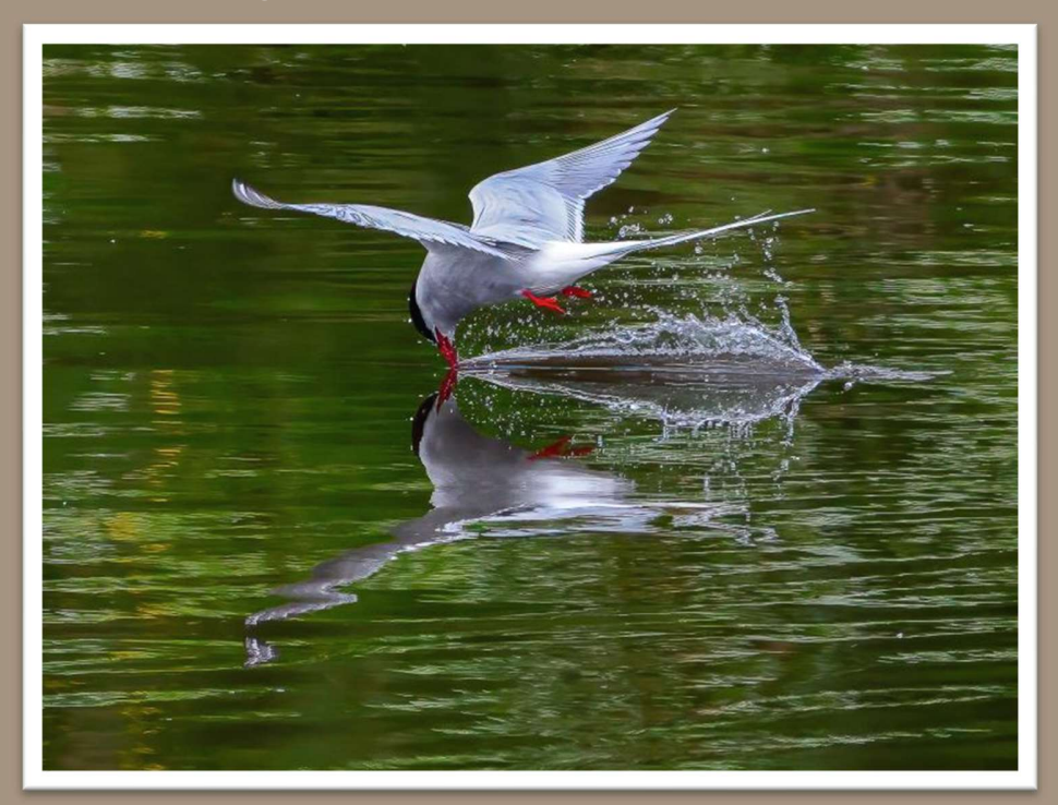
"Arctic tern fishing" – René Cason AFIAP