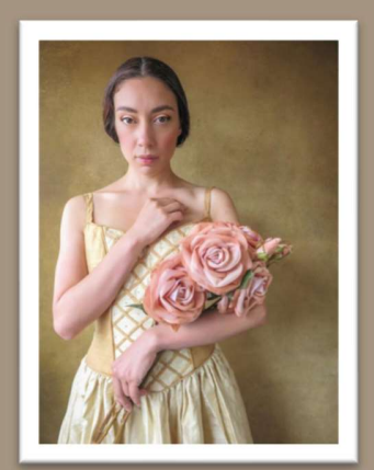
"The girl in the yellow dress"