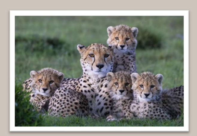
"Family Portrait - Nashipai and Cubs"