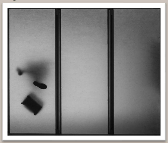
"Crossing the glass bridge" - Mick West