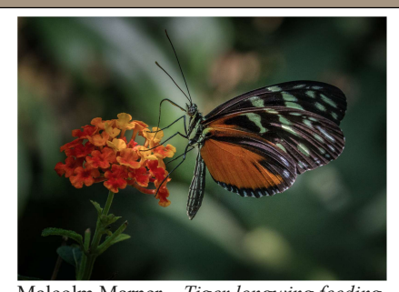
Malcolm Marner – Tiger longwing feeding.