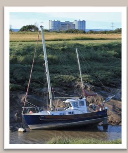
"Old and New Energy" - Jane Bodkin - Oldbury on Severn

On the next few pages you can view some of the images captured during summer club evenings, and either posted on the Club Galleries, or on Facebook.