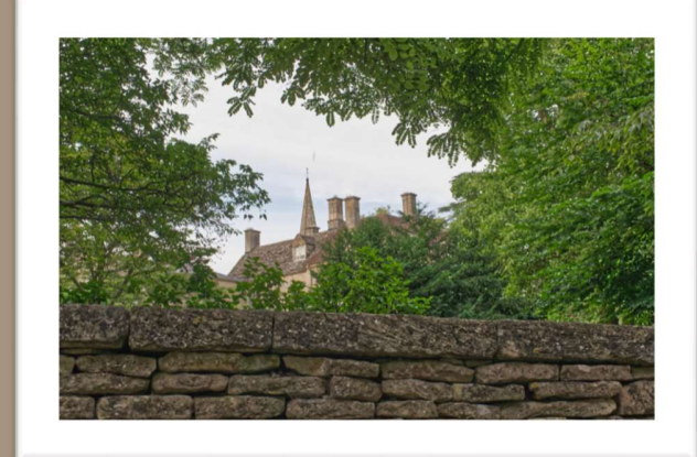
"A view through" – Chris Organ at Bisley – a good image to show at our member night "Frame within a Frame" on 5<sup>th</sup> October 2023

On the next few pages you can view some of the images captured during summer club evenings, and either posted on the Club Galleries, or on Facebook.