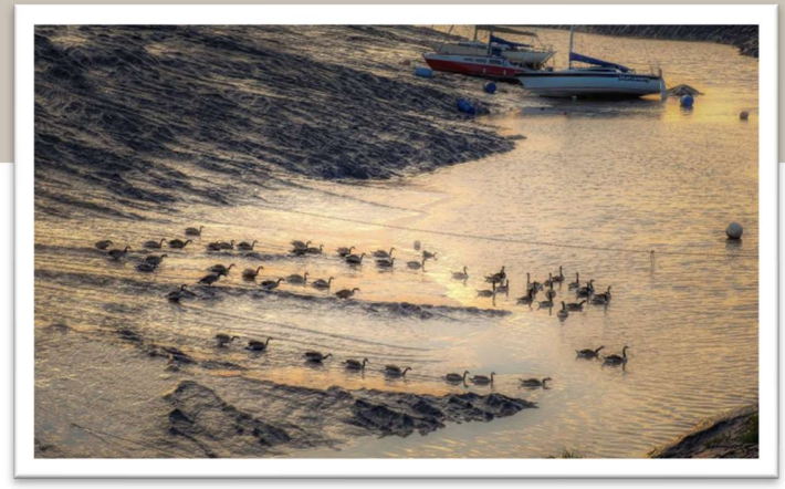
"Oldbury on Severn" – Annie Blick