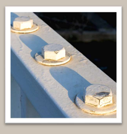
"Lego-esque" Mick West - Frampton