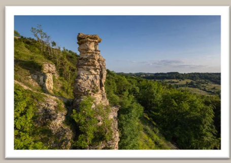
"Devil's Chimney"