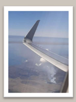
Margot Page witnessed the recent volcano returning from Iceland