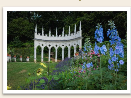
Rococo in summer plumage June 2023 – Trish Bloodworth