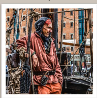
Nige Bowsher captured this gritty image at the Tall Ships Festival