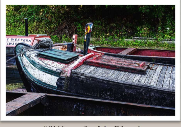
"Old barges" – John Edwards Black Country Living Museum