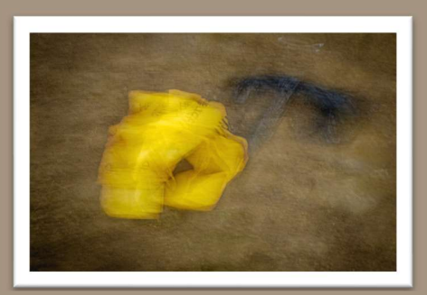
"Dropped Litter" Geoff Perrett at Pope's Wood