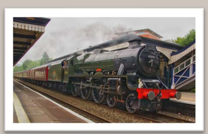
Glyn Heskins "The Bahamas at Stroud Station" shared on Facebook