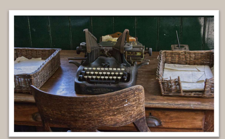
"How it was written" – Rhys Owen Black Country Living Museum