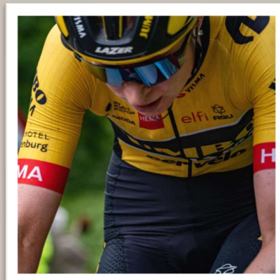
Patricia Sandford captured the finish of the Rene Cason captured the hill climb in the Women's Tour of Britain