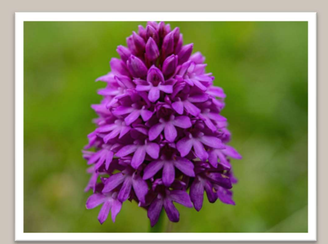
"Orchid" - Mervyn Dawkins - Macro at Daneway Banks

The themes for the evenings have been embraced by members, many of whom have been very much "out of their comfort zone" trying something different.