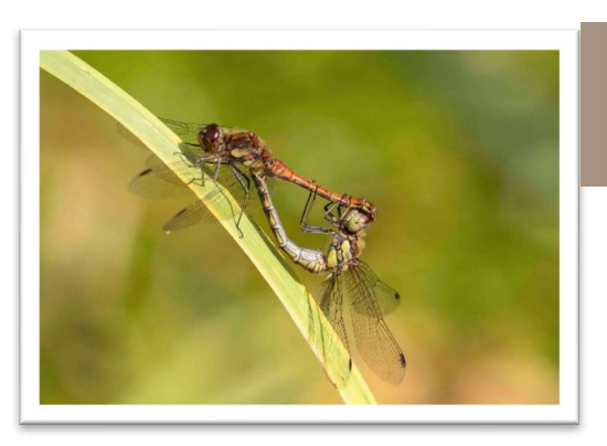
"Common darter valentine" – Trevor Blundell – Three-way team challenge – Top 10 image