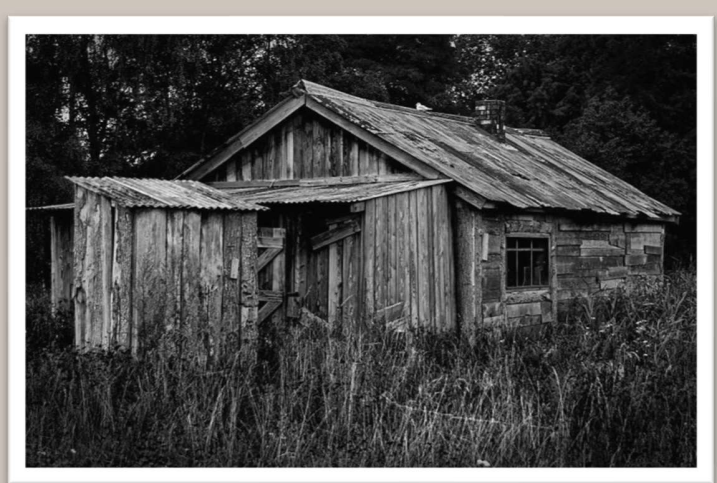
See more on our website: www.stroudcameraclub.co.uk