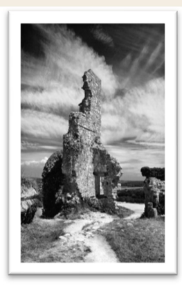
Beyond these castle walls - Derrick Whitmore Commended

Please send details of your acceptances or other external "wins" to secretary@stroudcameraclub.co.uk Apologies if you are missed here – please let me know so you can be added next time.