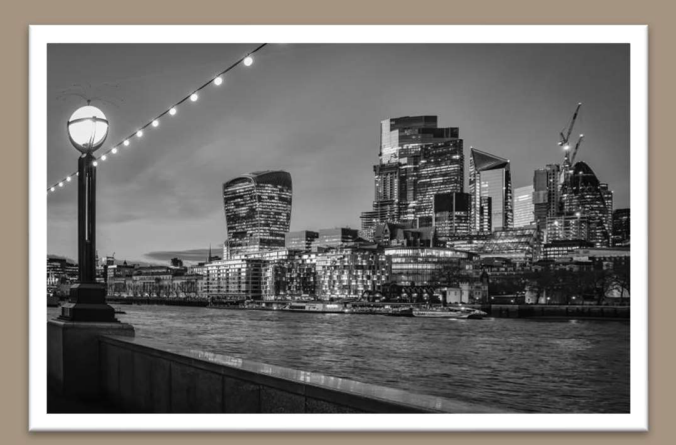
"Twilight in the city" Roger Matthews – 3<sup>rd</sup> Place