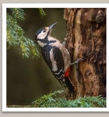
Jeff Kirby – Spotted Woodpecker Jeff has been asked for permission for this image to be reproduced in Amateur Photographer magazine