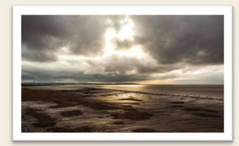
Trish Bloodworth – A bit of abstract