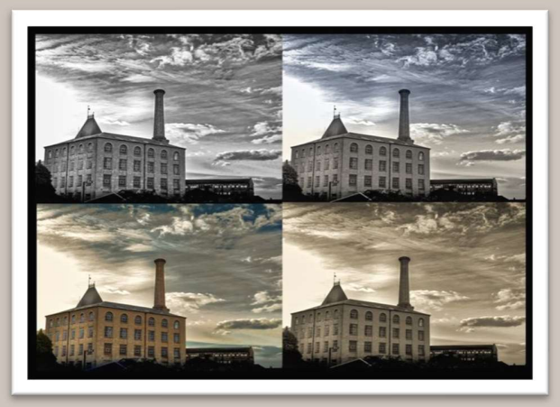
See more on the Facebook Group https://facebook.com/stroudcameraclub