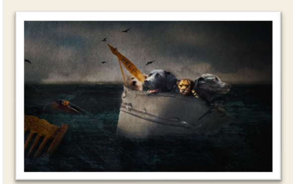
Trish Bloodworth – "S-O-S" FIAP Honorable Mention Cheltenham Salon

Andrew Harbin DPAGB – "Buchaille Etive Mor" CISP Silver: Landscape Cheltenham Salon