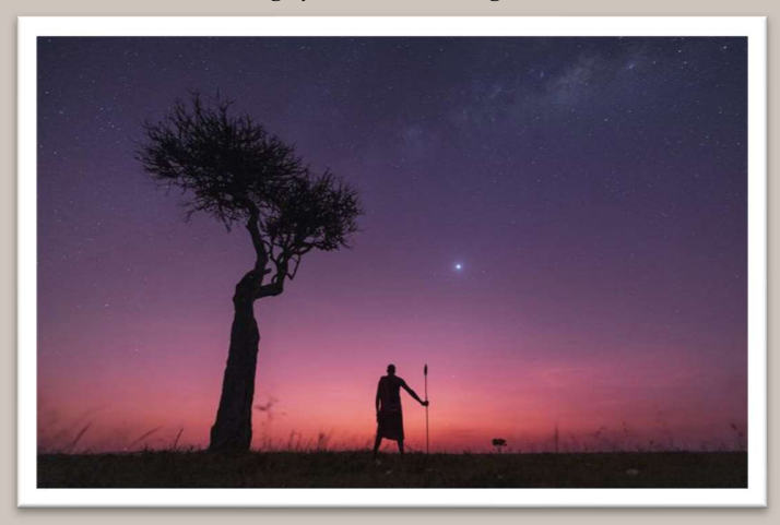
See more on our website: www.stroudcameraclub.co.uk