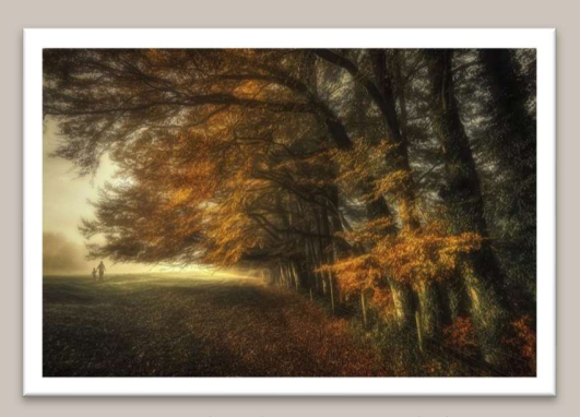
Autumn beeches – Annie Blick Highly commended - Digital