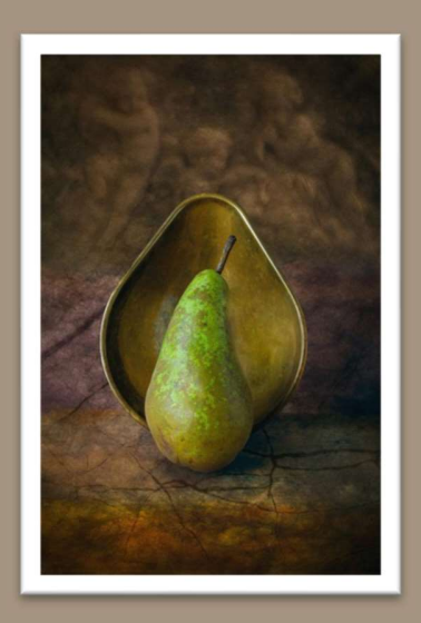
"Pear" Geoff Perrett – HC - Digital