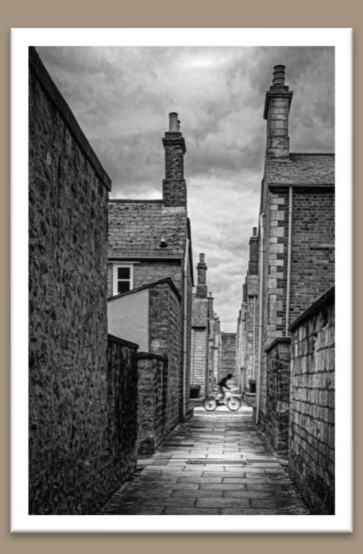
"Shortcut" Steve Vines – 2<sup>nd</sup> Place - Prints