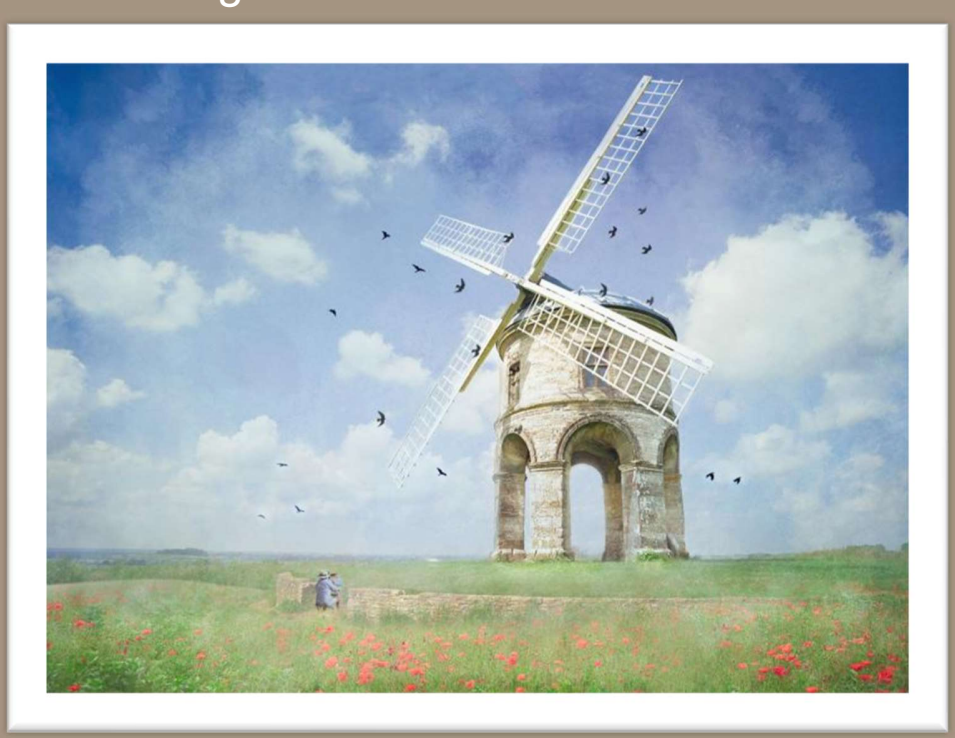
"Windmills of my mind" – Trish Bloodworth – 1^{st} Place