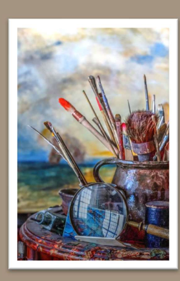
"Mr Turner's brushes" Margot Page – 2<sup>nd</sup> Place - Digital