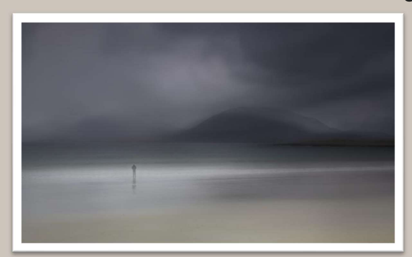
"Contemplation" – Andy Harbin 3^{rd} Place - Digital