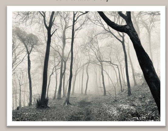
See more on our website: www.stroudcameraclub.co.uk