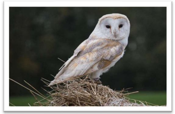
René Cason "Barnie the owl" 3<sup>rd</sup> place Group B

Remember My Stroud & District – see website for details – next quarter closes 30th June 2021