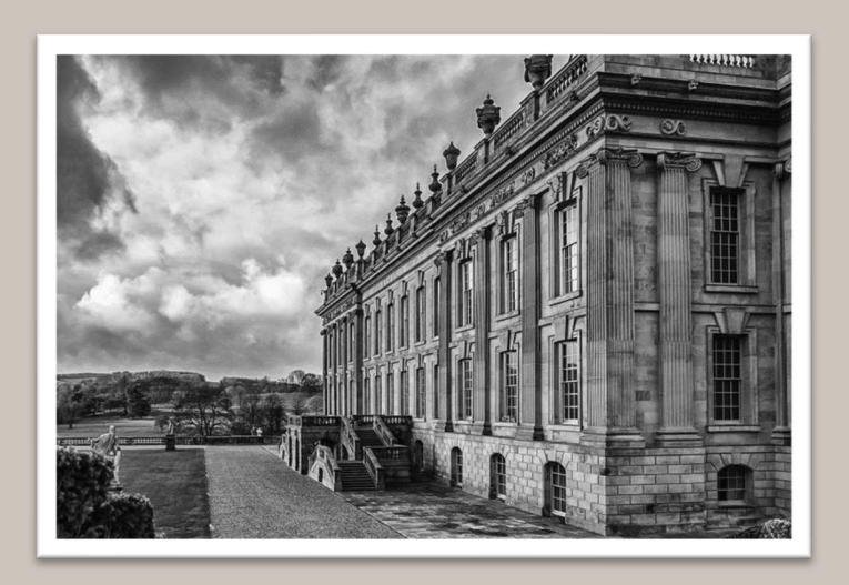
"Chatsworth" – Margot Page 2nd Place