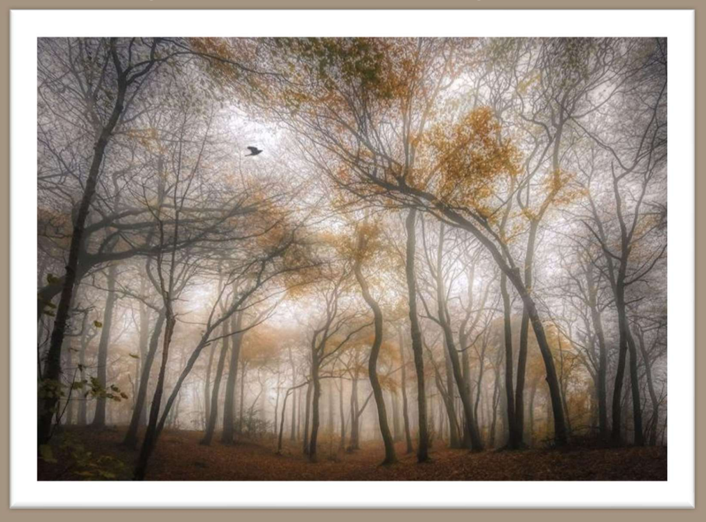
"Autumn Canopy" - Annie Blick - 1st place